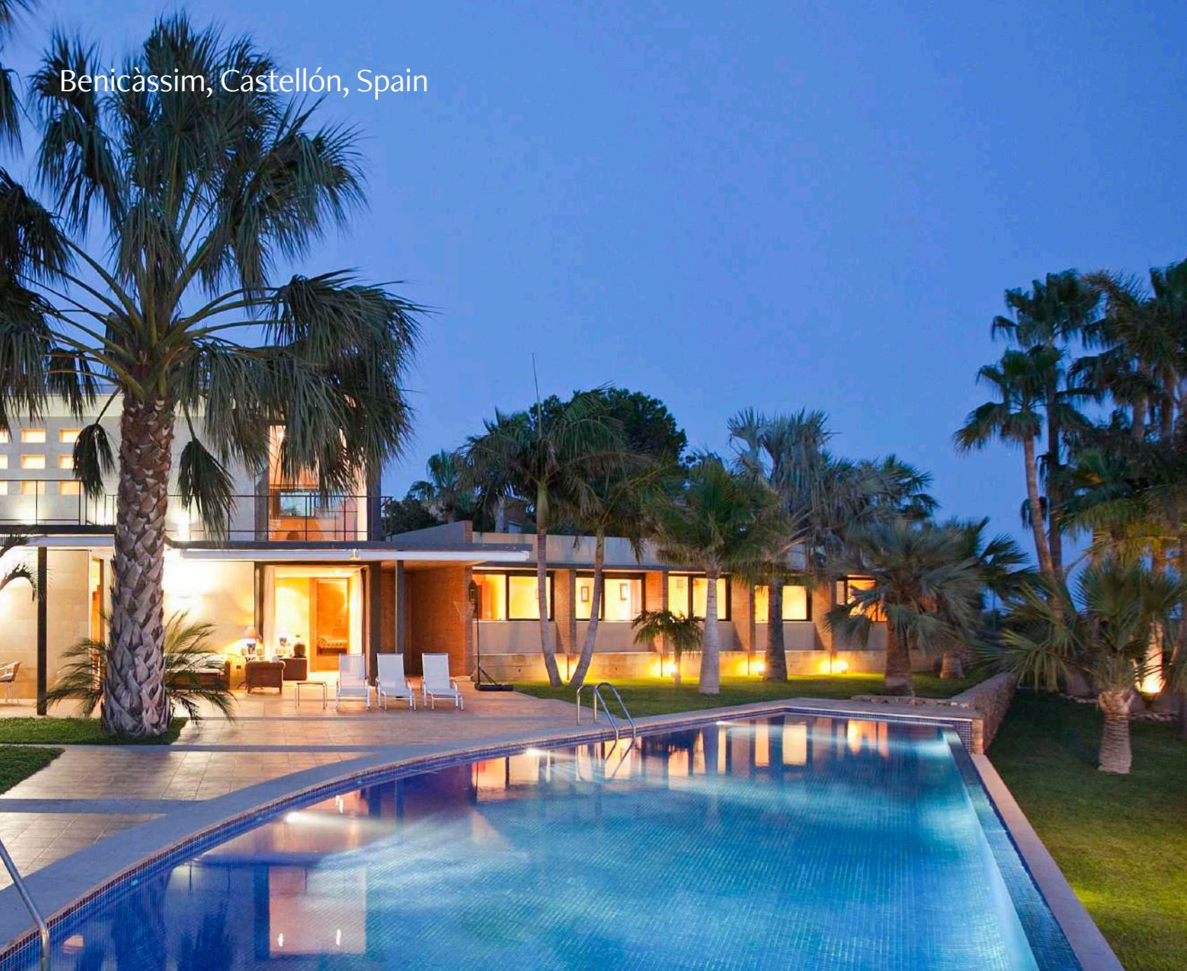
Benicàssim, Castellón, Spain

Forbes Global Properties showcase the world's finest homes.